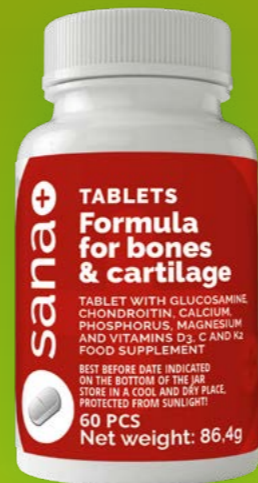
FORMULA FOR BONES