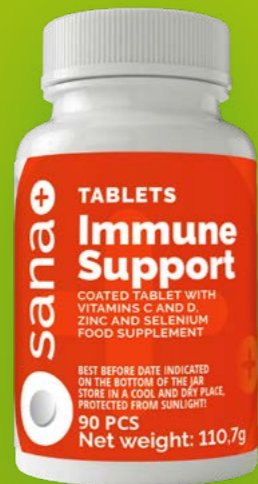
IMMUNE SUPPORT COATED TABLET