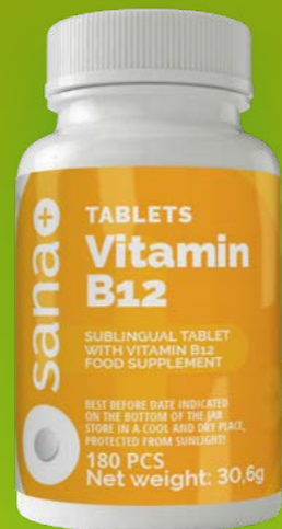
VITAMIN B12 1000 µg