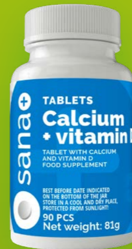
CALCIUM +VITAMIN D