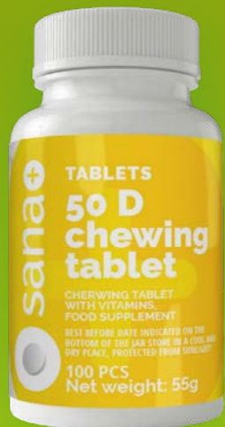
VITAMIN D 50 µg CHEWING TABLET

If you are tired of the drugs but still need your vitamin pills in the morning according to your special needs, our sana+ vitamin and mineral tablets are the perfect choice for you. You don't have to visit a doctor or a pharmacy but you still get all you need. For people who live responsibly.