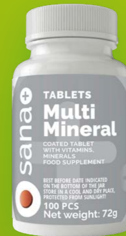
MULTI MINERAL COATED TABLET