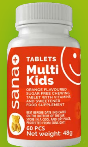
MULTI KIDS CHEWING TABLET