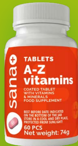
A-Z VITAMINS COATED TABLET